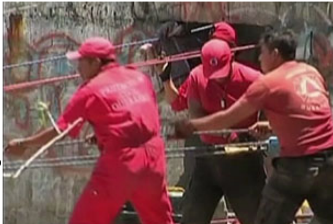
Mexican authorities are looking for more bodies in the abandoned mine ducts