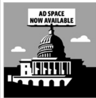
Letters: The Power of Money in Elections