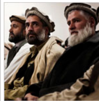
A Look at America's New Hope: The Afghan Tribes

Home | World | U.S. | N.Y. / Region | Business | Technology | Science | Health | Sports | Opinion | Arts | Style | Travel | Jobs | Real Estate | Automobiles | Back to Top Copyright 2010 The New York Times Company | Privacy Policy | Terms of Service | Search | Corrections | RSS | First Look | Help | Contact Us | Work for Us | Site Map