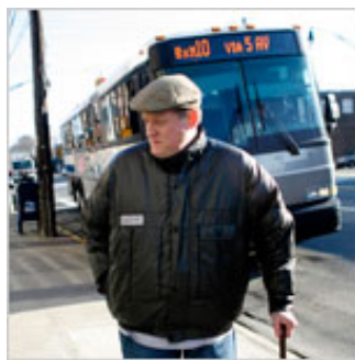
In a Slice of the Bronx, No Banks in Sight, for Now