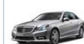
$58,655 2010 Mercedes-Benz E-Class