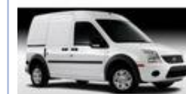
2010 Ford Transit Connect