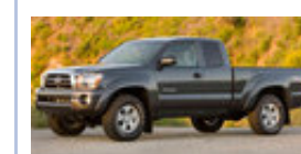
2010 Toyota Tacoma