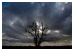
Week in Photos: Jan. 19-25