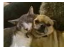
myRecord: Pets - 14 NEW