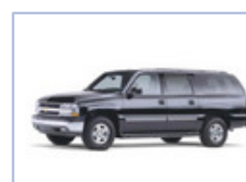
2005 Chevrolet Suburban